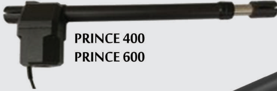
PRINCE 400 PRINCE 600